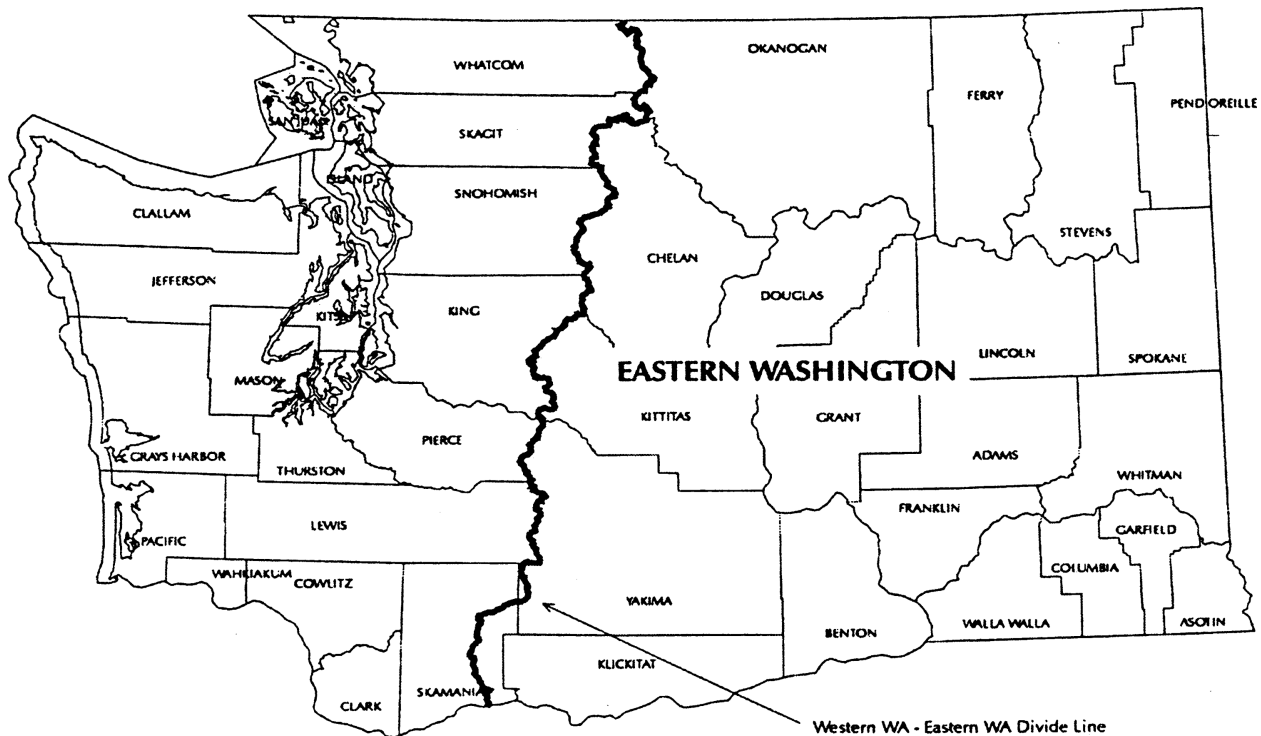
Eastern Washington Definition Map

"Eastern Washington timber habitat types" means elevation ranges associated with tree species assigned for the purpose of riparian management according to the following: